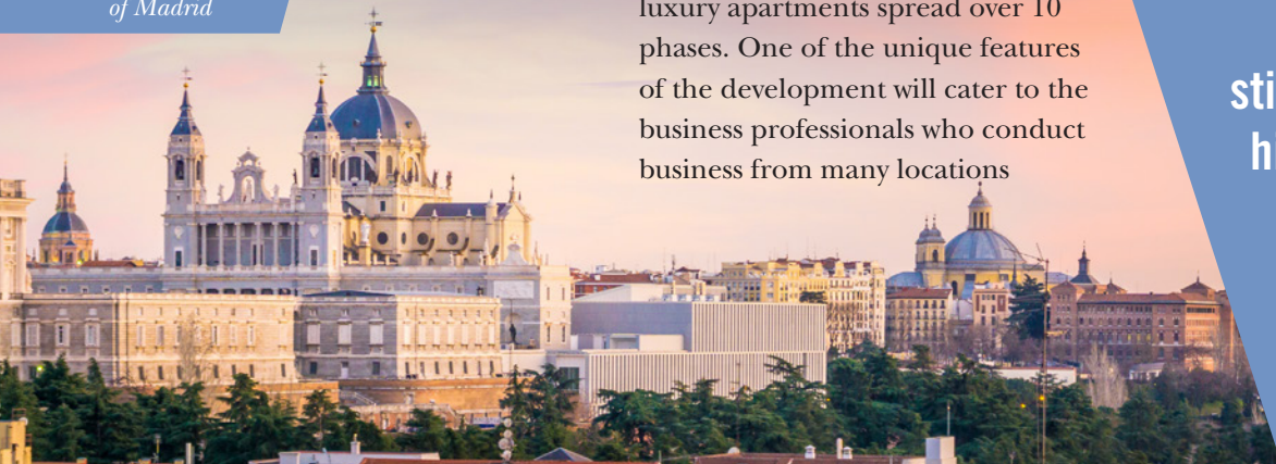
The Cathedral of Madrid

While prices have still not returned to the highs achieved before the recession, overseas buyers and investors are back in the market.